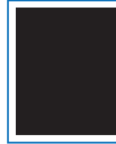
Full Page Ad 8.5" x 11"