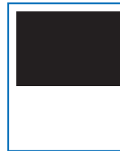
Half Page Ad 8.5" x 5.5"